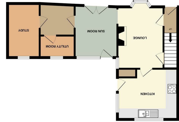
GROUND FLOOR 535 sq.ft. (49.7 sq.m.) approx.

Whilst every attempt has been made to ensure the accuracy of the floorplan contained here, measurements of doors, windows, rooms and any other items are approximate and no responsibility is taken for any error, omission or mis-statement. This plan is for illustrative purposes only and should be used as such by any prospective purchaser. The services, systems and appliances shown have not been tested and no guarantee as to their operability or efficiency can be given. Made with Metropix ©2023