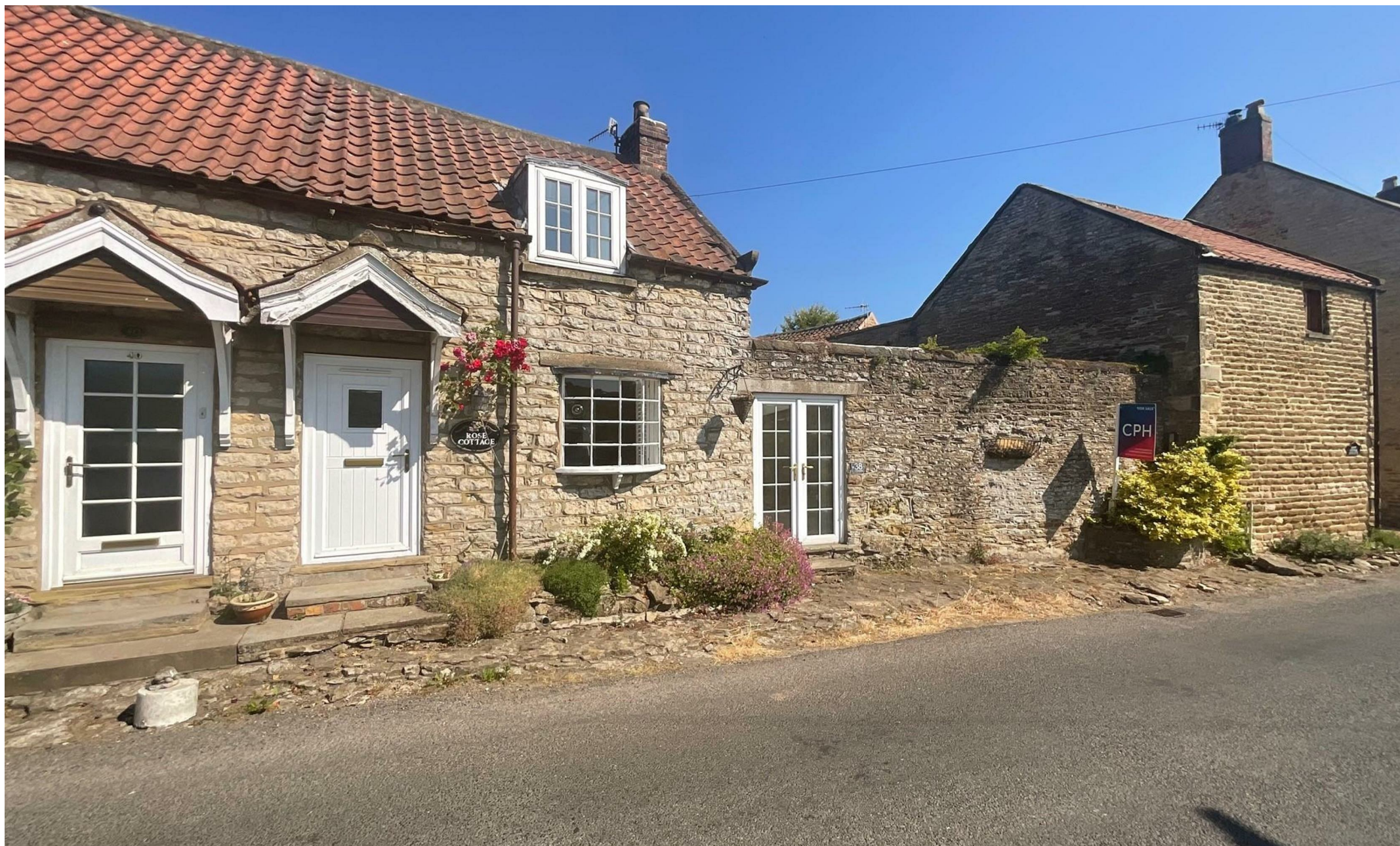
38 Castlegate, East Ayton, Scarborough YO13 9EJ Auction Guide £150,000